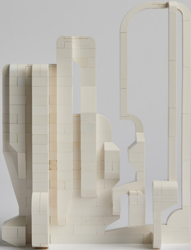
Lost Tablet Runner, 2021 19cm x 24.5cm x 3 cm Reconfigured Lego AUD 4200