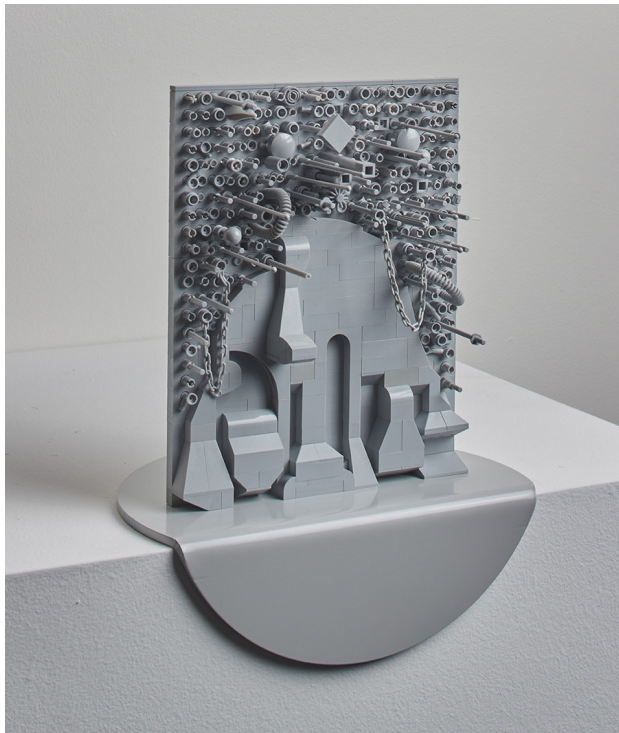
Lost Tablet Alouete I on a folded colour-matched powder-coated steel base.