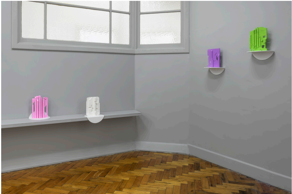
An installation of Lost Tablets in the Salon of Sarah Scout Presents in April 2021.

The table-mounted type allows for the optional addition of a hand-blown glass vitrine (at cost).