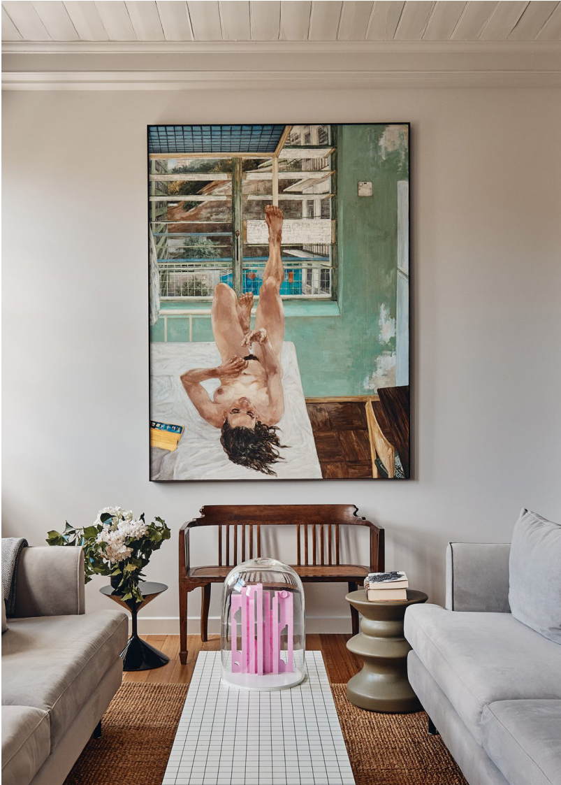
Lost Tablet Fleetwing installed on Zanotta's Superstudio table in a collector's home in Fitzroy.