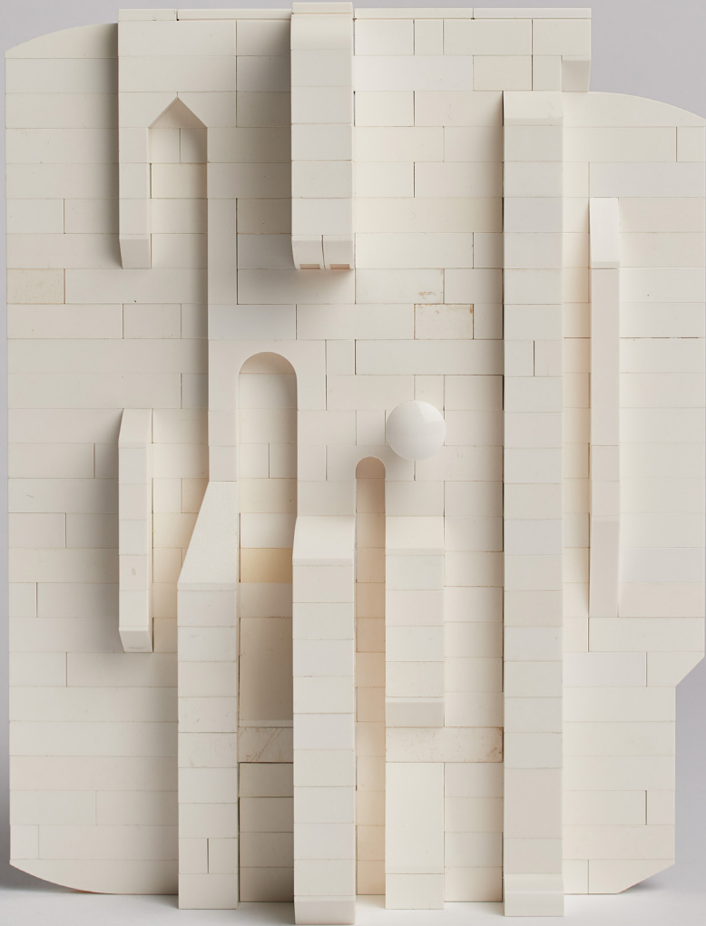
Lost Tablet Baychimo, 2021 19cm x 24.5cm x 5.2cm Reconfigured Lego AUD 4200